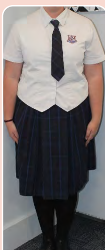
Skirt with stockings