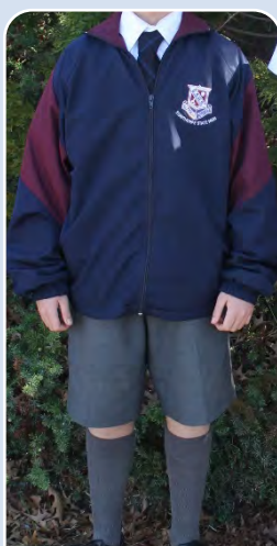
Formal with Track Jacket