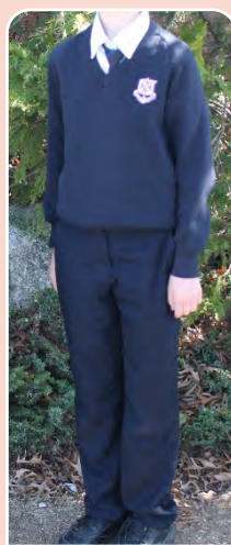
Formal Navy Pants, V-Neck Jumper