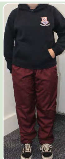
Senior with Track Pants and Hoodie