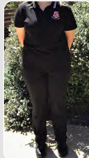
Hospitality Girls Uniform