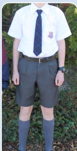
Formal with Shorts