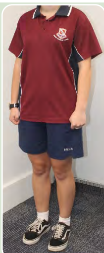
Junior with Shorts