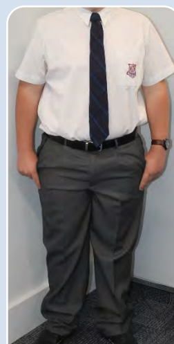
Formal with Trousers