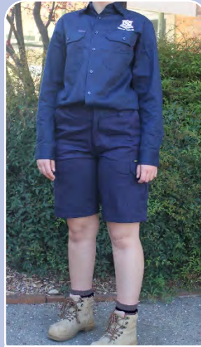
Trade Trading with shorts