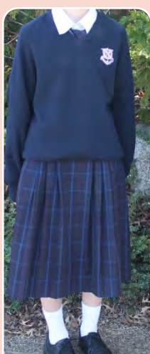
Shirt with white socks