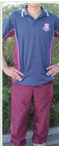
Senior Track Pants