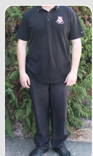
Hospitality Boys Uniform