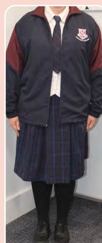
Formal with Track Jacket