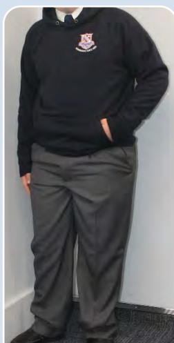
Formal with Hoodie