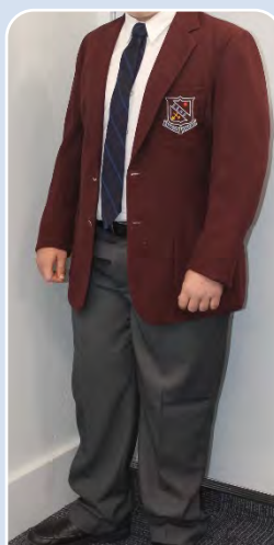
Formal with Blazer