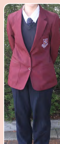
Formal with Blazer