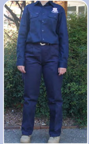
Trade Training with long