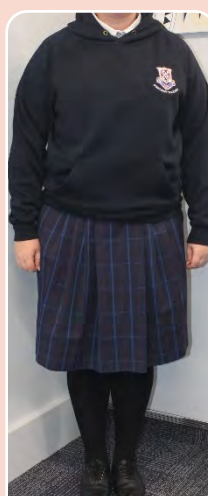
Formal with Hoodie