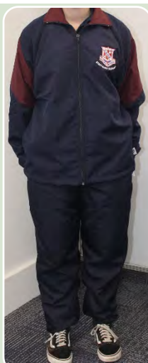
Junior Track Pants and Jacket